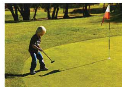
ARLINGTON PARK PROGRAM 2025